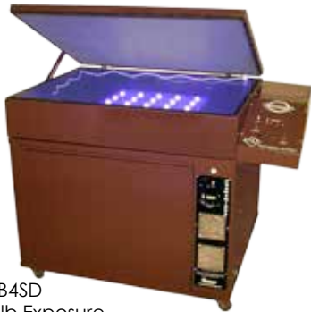
LED2434B4SD LED 4 bulb Exposure unit with ScreenDryer