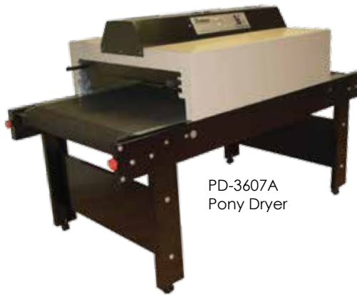
PD-3607A Pony Dryer